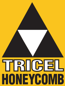
Exhibit and Museum