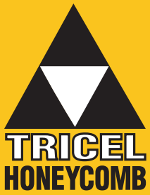
Exhibit and Museum